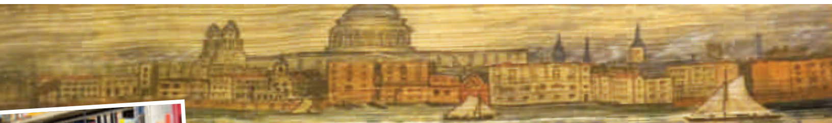
This "fore-edge painting" of St. Paul's Cathedral and the River Thames is executed on the front paper edges of The Book of Common Prayer .

The Department of Special Collections and Archives purchased this work with funds donated to the University Libraries' Special Collections Fund. The work was felt to be an appropriate and meaningful addition to the collection as Special Collections and Archives already houses over 65 editions of the BCP, including six 17th-century editions and the first American edition of this work. The 350th anniversary of the 1662 revised edition of the BCP, still in official use today, was also marked in 2012. Additionally, Special Collections and Archives holds a significant collection of fore-edge paintings.