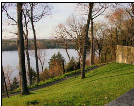
Mohican State Park