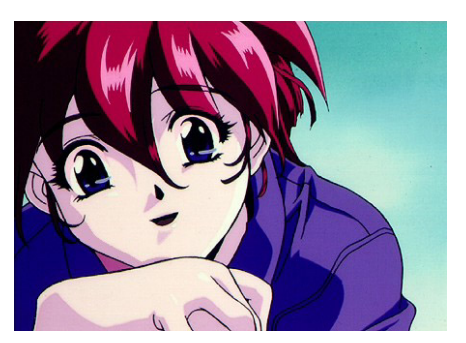
From the Bakuretsu Hunters Series

Oh yes, the call number/fiction designation. The OCLC Forest Press staff prefers that these materials be classed in the 741.5 range of