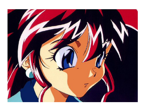
From the Bakuretsu Hunters Series

fact, all these books are so successful that they have generated markets for affiliated materials: books on drawing manga (Japanese comics or cartoons), movies, television series, MTV, music, and video games. These mediums in turn create more of a demand for the books and create new series. The result is that there is constant cross-pollination among all these formats, resulting in an endless flow of new titles.