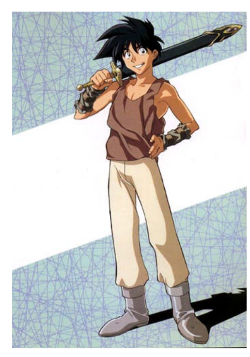
From the Bakuretsu Hunters Series

Phone: 614.416.2258 Fax: 614.416.2270 www.olc.org