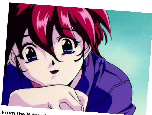
From the Bakuretsu Hunters Series