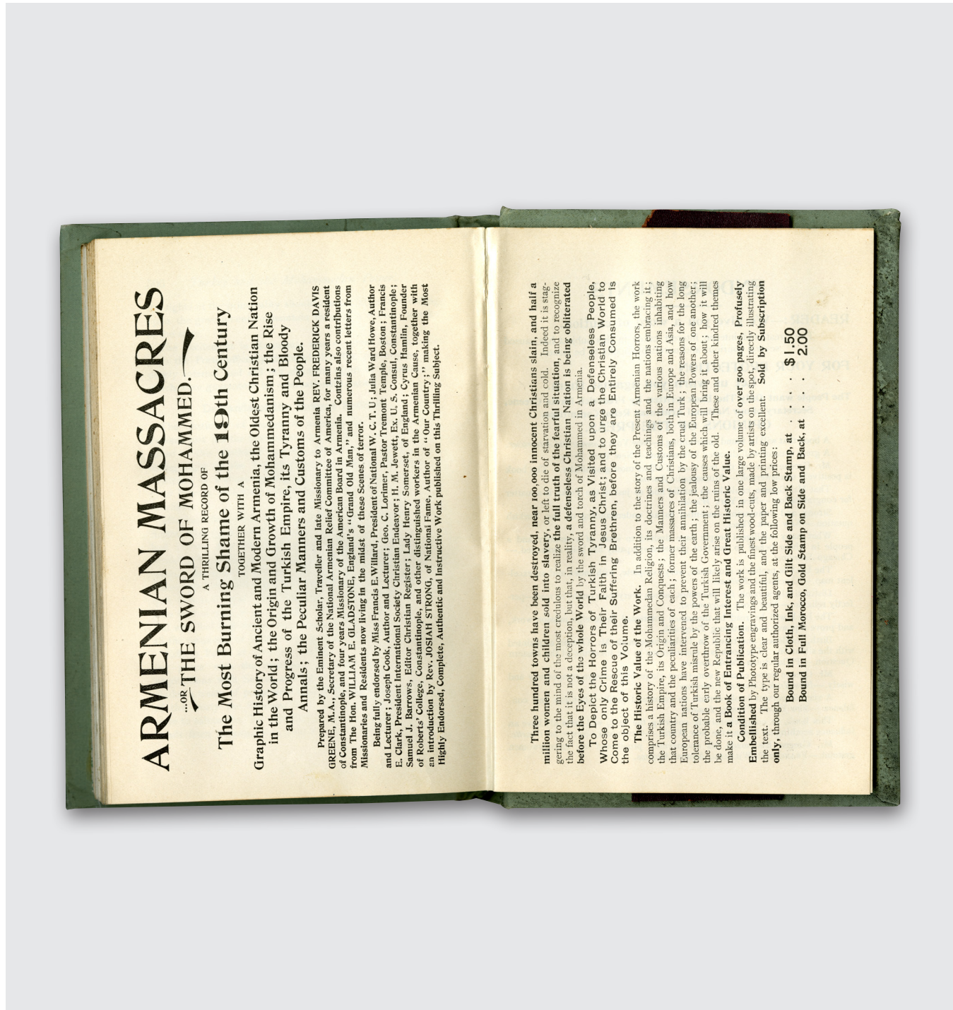
Illustration 4 Prospectus as a full sheet folded in half, shown as bound into volume (Entry 37)