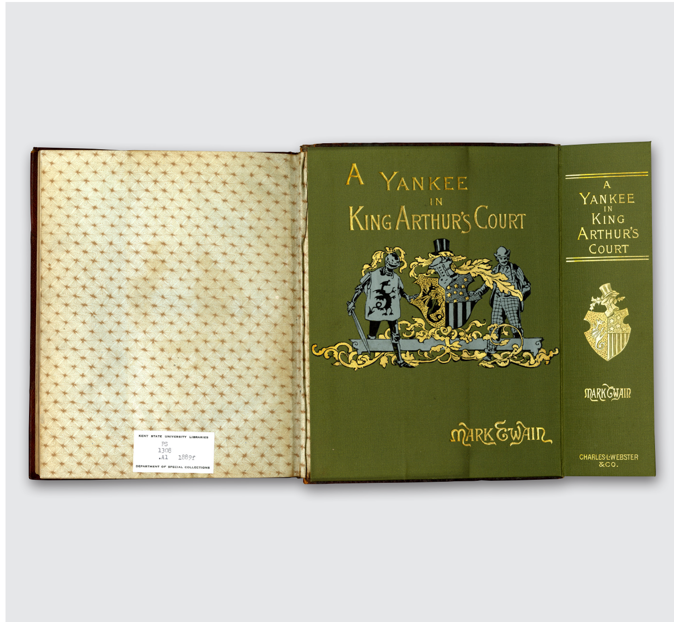
Illustration 1 A fold-out alternate binding mounted inside the lower cover (Entry 53)