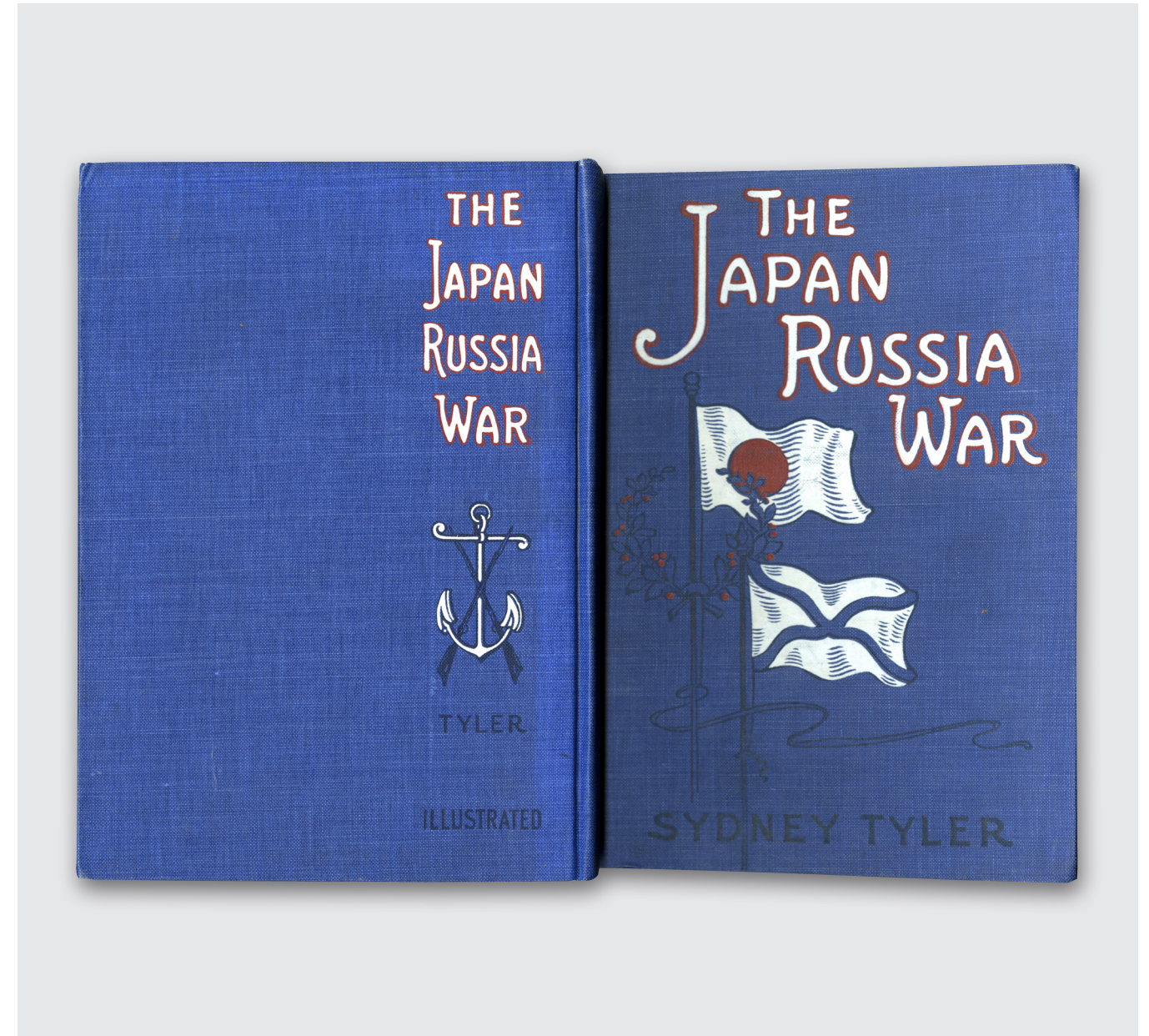
Illustration 2 Sample full size spine design, included on back cover of canvassing volume (Entry 66)