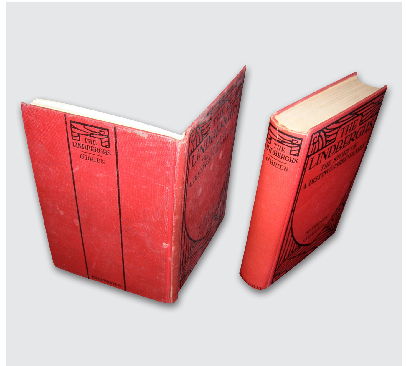
Illustration 6 Canvassing volume (left) shown with the fully published version of title (Entry 14)