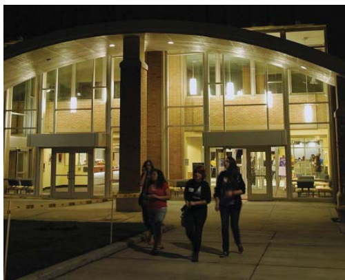
New Main Library entry at night

We are thrilled to be going into this year with new, very attractive spaces to offer our users. The redesigned Risman Plaza leads to a stunning new front entry for the Main Library. Once inside you will be struck by the bright, roomy lobby and a completely updated Circulation area. The changes are certainly bringing students in, and once there, we are committed to offering them services and an overall environment that contribute to their success.