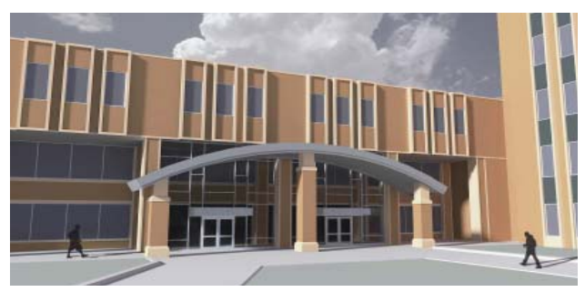
Planned exterior entry