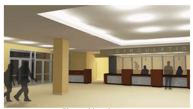
Planned interior entry