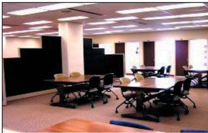
Area 6B has six large library tables and seating for 24. Chairs are movable. Portable whiteboards are available.