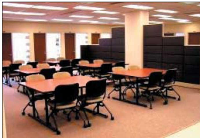
Area 6A has six tables and seating for 24. Tables and chairs are movable. Teacher's workstation and whiteboards are available.