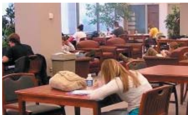
Quiet Study Area

We hope to be able to address some of these needs in the coming months.