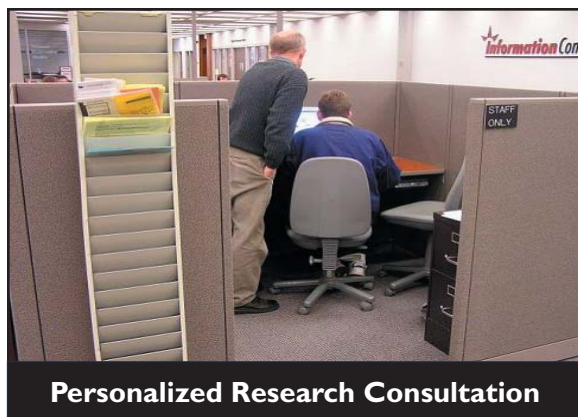
Personalized Research Consultation

Tutoring services from the Academic Success Center and the Writing Center are available to students in the Main Library on Monday through Thursday on a drop-in basis. Math tutoring is for MATH 10004 through MATH 12003 and is available from 2—7 p.m. Writing tutoring is offered 5– 7 p.m. Librarians offer personalized research consultation by appointment arranged at the Reference Desk or at 330-672-3045. All of these services are heavily used by students. In spring 2005, for example, there were over 700 math tutoring sessions conducted.